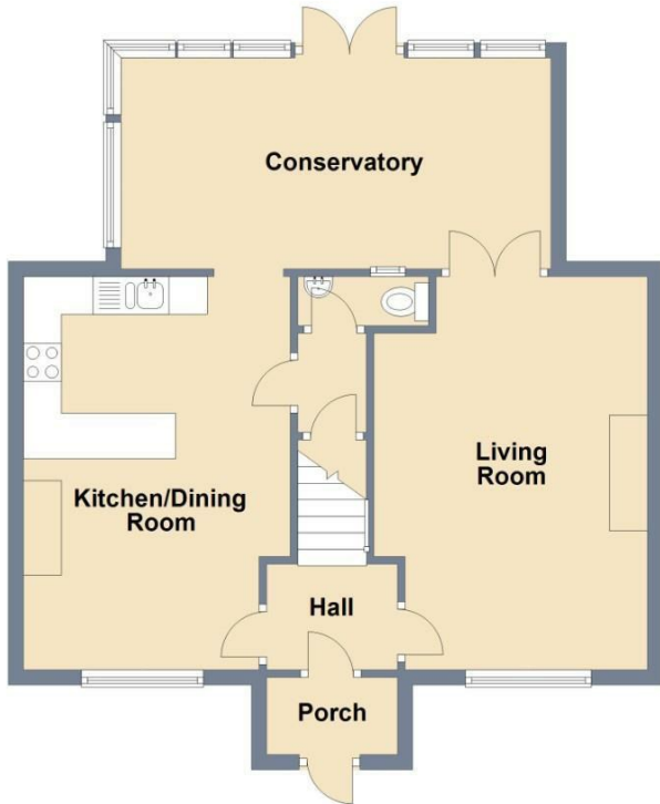
Ground Floor Approx. 61.1 sq. metres (658.1 sq. feet)